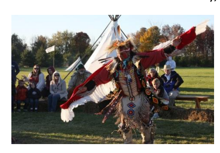
Buffalo Big Mountain

Kettle Korn), and Many Other Events on Going All 3 Days