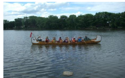
28' Northwest Fur Company. Canoe

Ashippun Town Hall 6 miles south of Hwy. 60 6miles north of Hwy. 16 Corner of Co. Hwy. O & P Ashippun, WI 53003