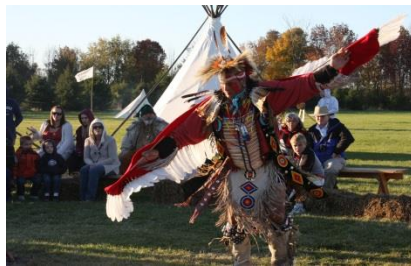
Buffalo Big Mountain

Period & Native Traders, Horse Drawn Carriage, Black Smith, Flint Knapper, Face Painting, Trapper, Cannons, Indian Artifact Display, Period Food, (Fry Bread, Buffalo Burgers, Timberline Chili, Mountain Man BBQ, Kettle Korn), and Many Other Events on Going All 3 Days